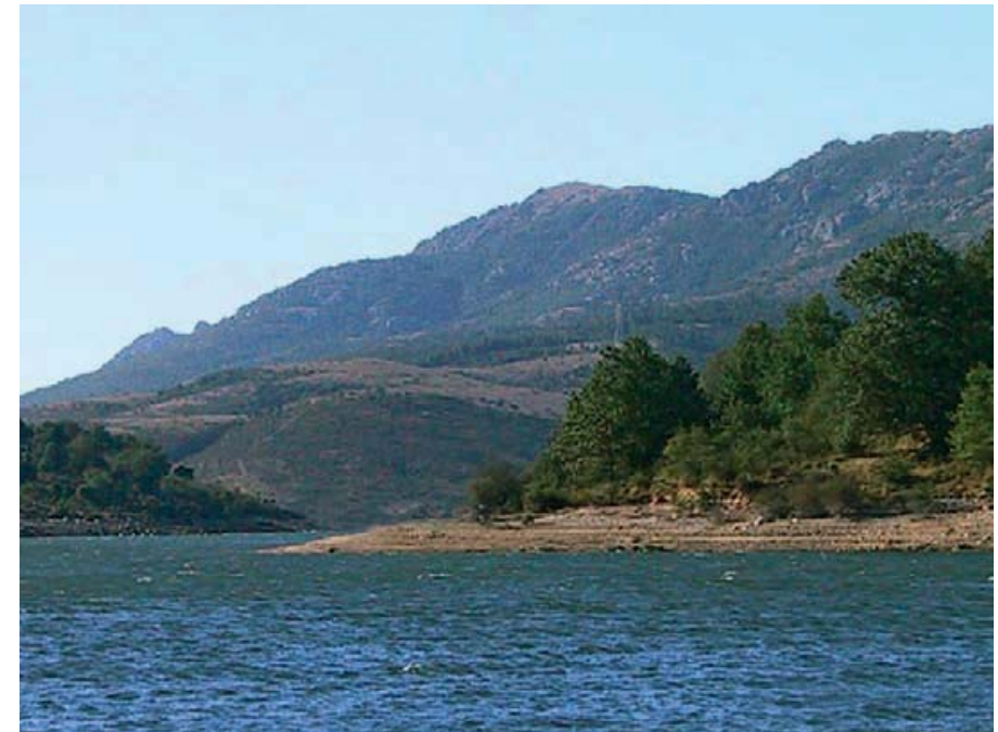
Flumendosa lake - Sardinia