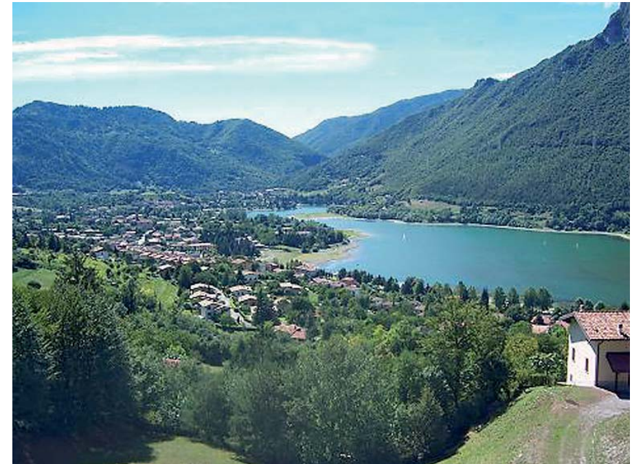
Idro lake - Lombardia