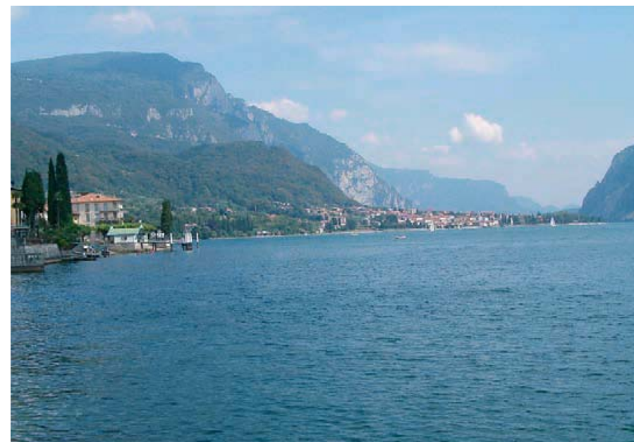
Como lake - Lombardy