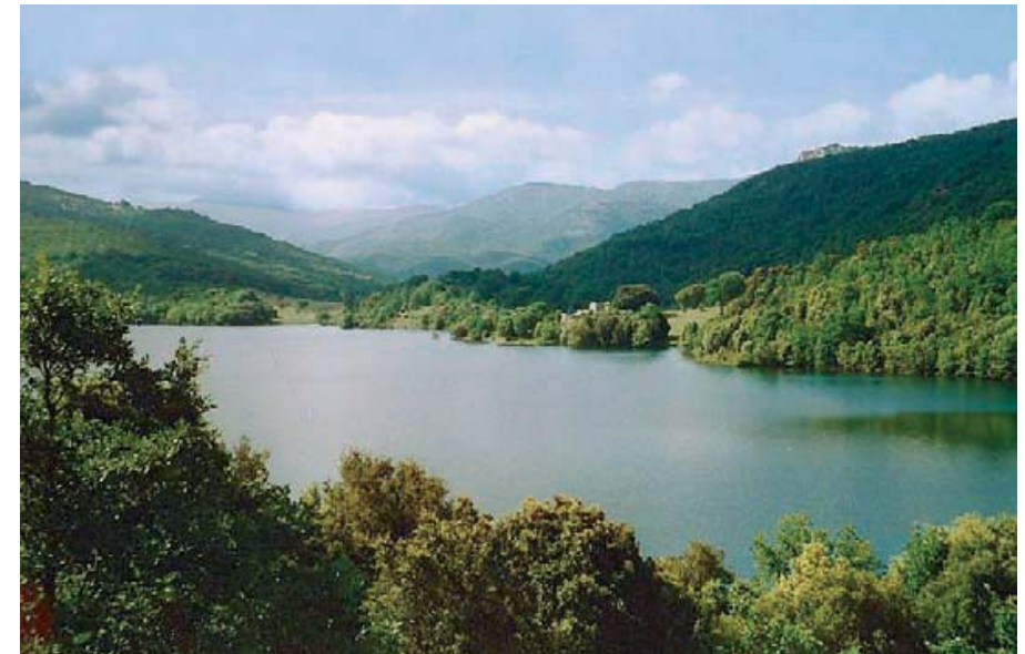
Gusana lake - Sardinia