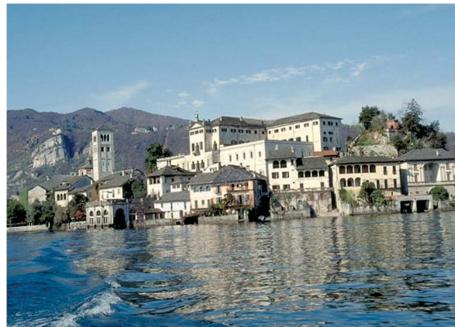
Maggiore lake - Piemont