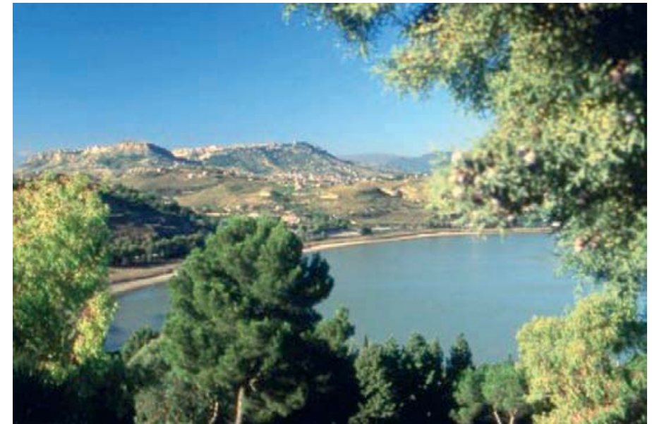
Pergusa lake - Sicily