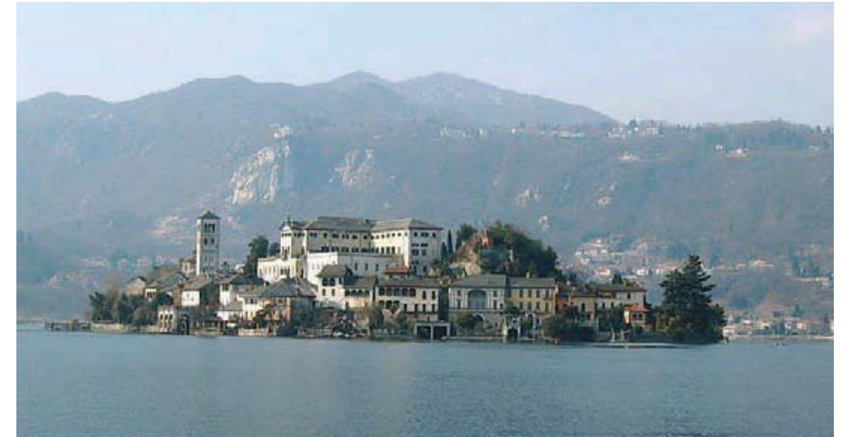
Orta lake - Piedmont