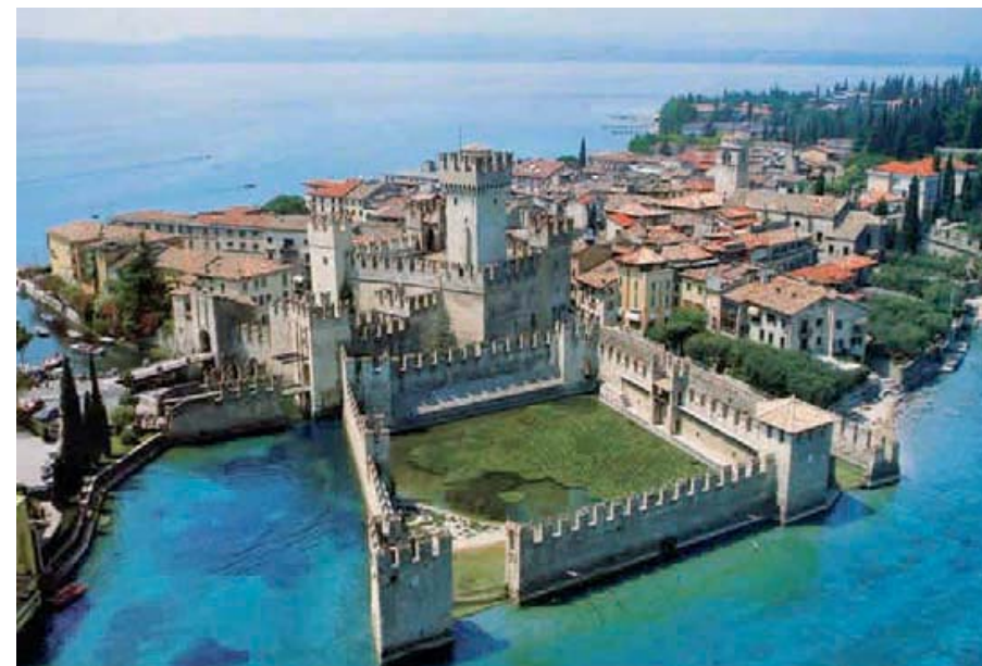
Garda lake - Veneto