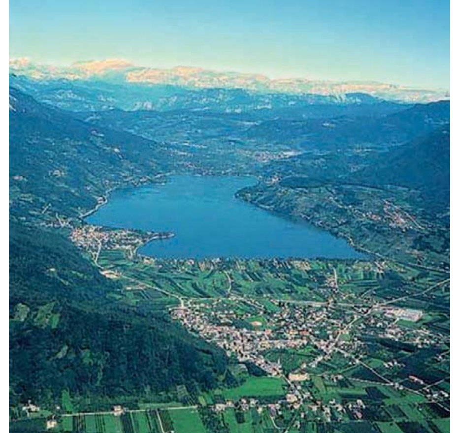
Caldonazzo lake - Trentino Alto Adige