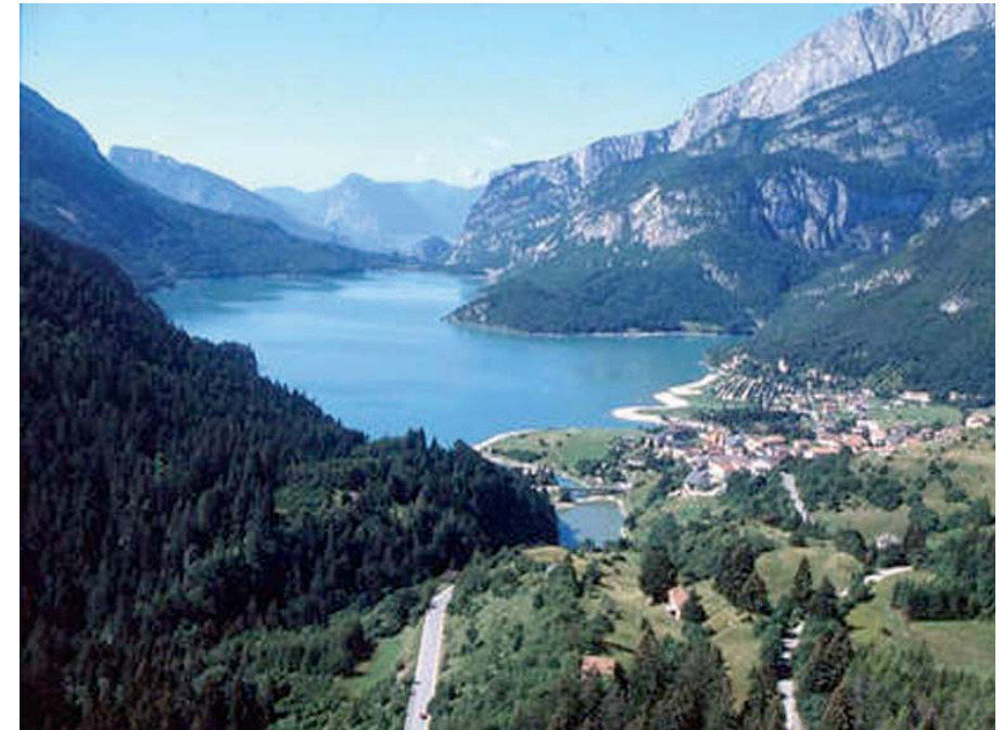
Molveno lake - Trentino Alto Adige