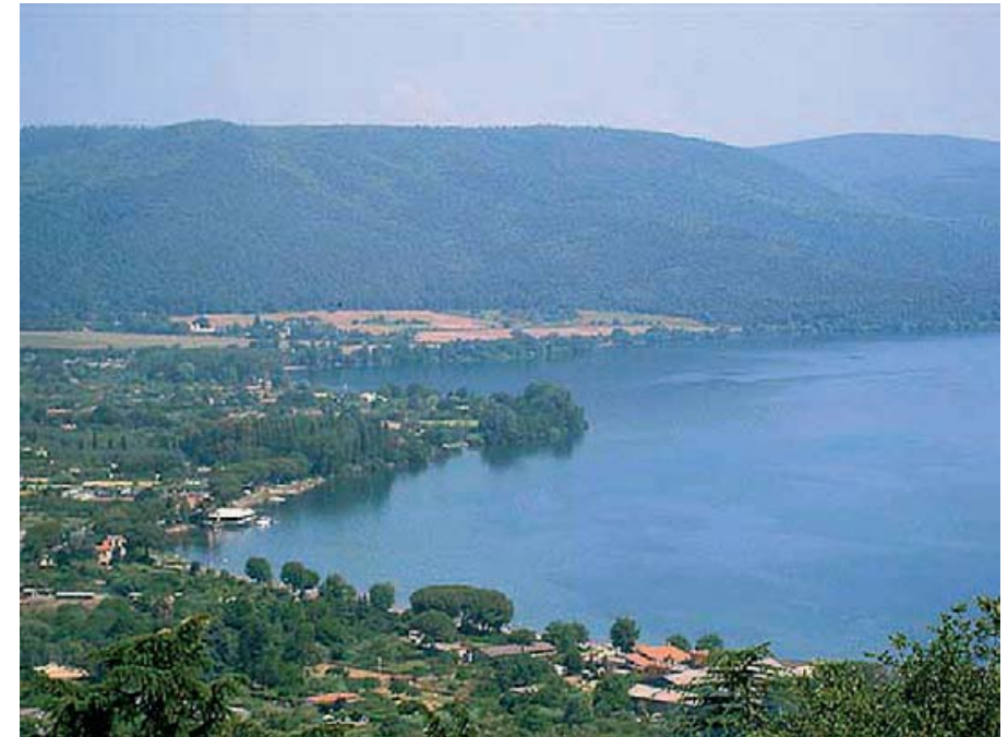
Bracciano lake - Latium