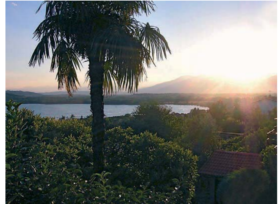
Viverone lake - Piemont