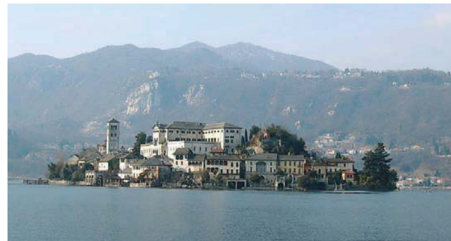
Orta lake - Piedmont