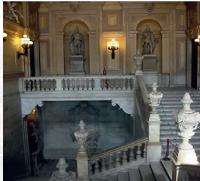
Palazzo Madama - Torino