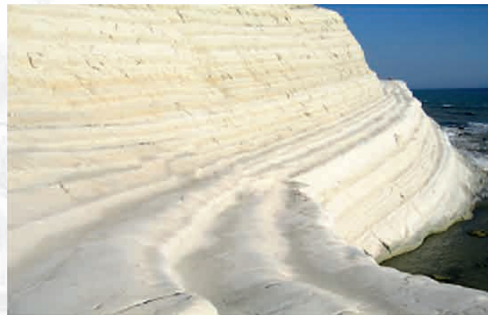
Scala dei Turchi - Agrigento