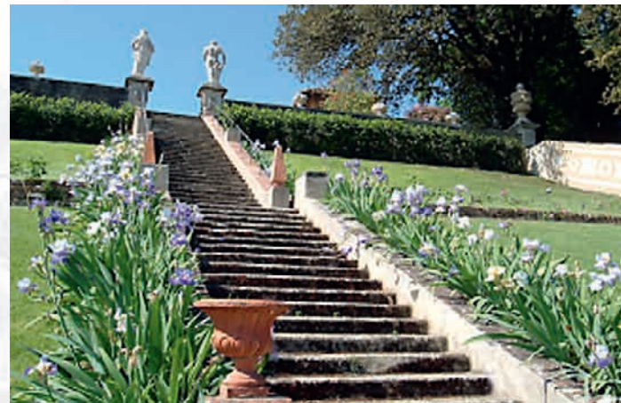
Baroque flight of steps - Bardini Garden - Florence