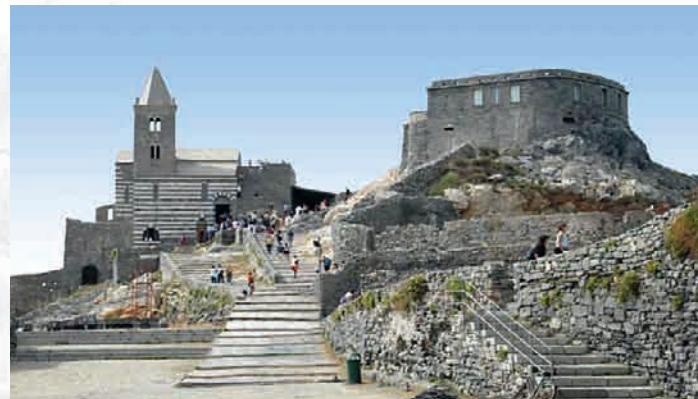
Scala Riomaggiore - La Spezia