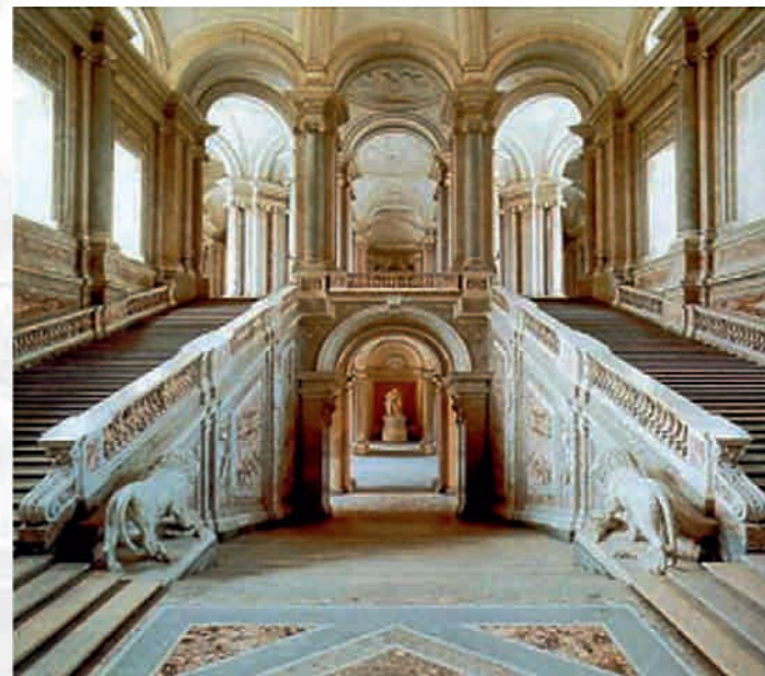
Reggia di Caserta