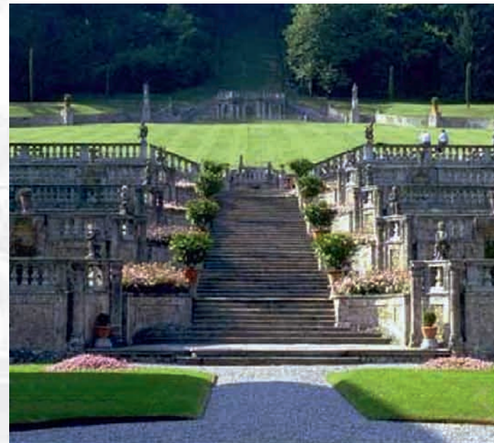
Villa Della Porta Bozzolo - Casalsuigi - Varese