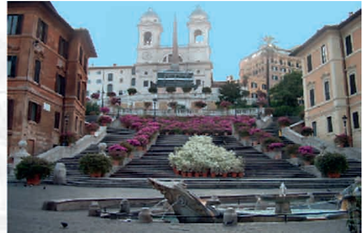
Trinità dei Monti - Roma